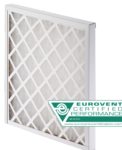
RedPleat Coarse and ePM10%.

RedPleat Ultra Coarse 70% have antimicrobial treated media.